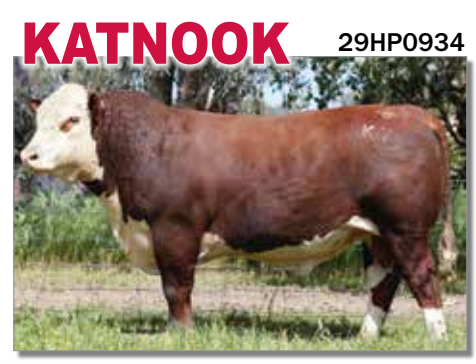
WIRRUNA KATNOOK K74 (AI) (P) Owned by Wirruna.