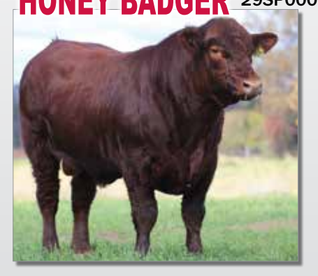
FUTURITY HONEY BADGER H135 (P) (AI) Owned by Futurity.