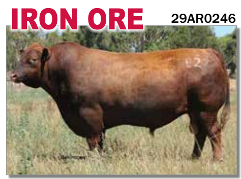
PARINGA IRON ORE E27 (AI) (AMF-NHF-CAFU-DDF-MAF) Owned by Paringa Livestock Pty Ltd and ABS Australia.