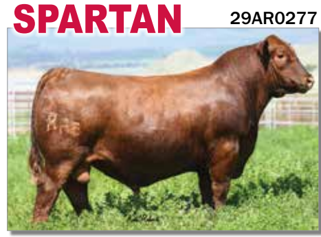
BIEBER SPARTAN E639 (AMF-NHF-CAF-DDF-MAF-OSF-OHF-DWF) Owned by Bieber Red Angus, SD; ABS Global, Inc., WI.

Angus R/N USA3762927 Red Angus R/N USAM3762927 Born 30/04/2017 BW 38kg W/205 375kg Y/365 575kg Sc 27mo 45cm