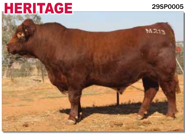
SPRYS HERITAGE M213 (P) (ET) (AI) Owned by Outback Shorthorns.