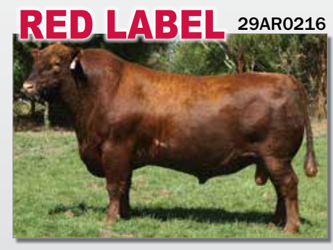
TE MANIA RED LABEL Z1023 (AI) (ET) (AMF-NHF-CAF-DDF-MAF-RGA) Owned by ABS Australia.