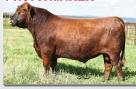
WFL PROFITMAKER E7030 (AMF-NHF-CAF-DDF-MAF-OSF-OHF-DWF-MHF) Owned by Wedel Red Angus, KS; ABS Global, Inc., WI.