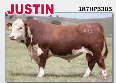
WIRRUNA JUSTIN J13 (AI) (P) Owned by Wirruna and Crown Point Pastoral.

Reg. No. WNAJ13 Born 06/08/2013 Poll PH 99% Homo Poll Eye 100/100